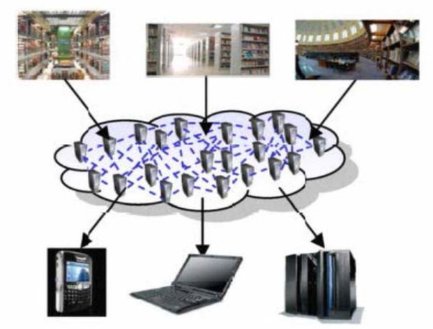
Figure 3 Use of Cloud Computing in University Library

With the rapid development of various IT technologies, users' information requirements are progressively adapted and now more and more libraries sponsored user-centered services. So librarians should mine and study users' information desires frequently and only in this way, they can master the basic demands of their users and furthermore, library can develop itself according to such information and improve users' fulfillment. University library, as we all know, is well-known for its hypothetical and teaching influences. And IT technology has been the driving force of library development. What's more, librarians can keep using new technology to develop library and enhance library services. With the growth of Cloud Computing request, this paper anticipated to apply Cloud Computing in libraries. By establishing a pubic cloud among many university libraries, it not only can conserve library resources but also can improve its user satisfaction, and it can be illustrated in figure 3.